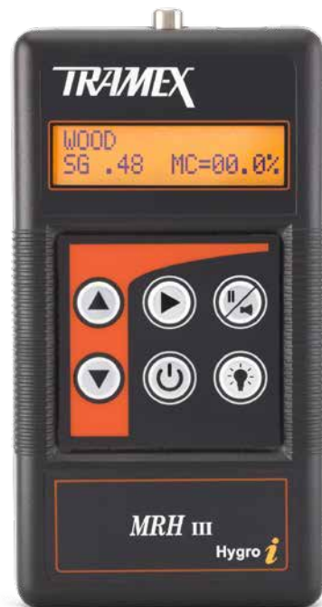
Product order code: MRH3

The Moisture and Relative Humidity MRH III is a hand-held digital moisture meter calibrated for most building materials. It also incorporates optional plug-in heavy-duty pin-type wood probes and Hygro-i2 ® probes for measurement of relative humidity and ambient conditions and allowing for testing of concrete per ASTM F2170 or BS 8201 (with optional sleeves or hood). Suitable for many industries including Flooring, Water Damage Restoration, Indoor Air Quality, Home Inspection and Pest Control.